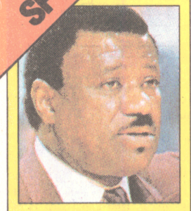
NOLAN RICHARDSON: A hero in Arkansas, 1C

HUGE EXPECTATIONS FOR BASKETBALL PROGRAMS BEHIND TURNOVER, 1,10C ▶ JOBS, CANDIDATES, 1C ▶ ARK. COACH INSPIRES, 1C ▶ FINAL FOUR NOTES, 3C